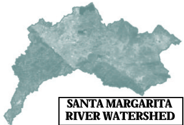
SANTA MARGARITA RIVER WATERSHED